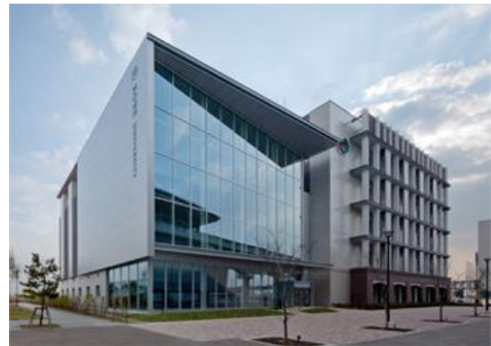
Kobe University Convention Hall