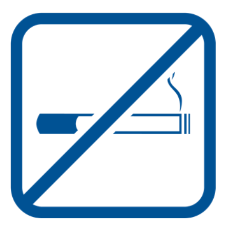
CERN = non-smoking non-fumeur