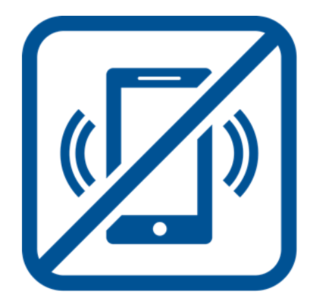
During presentations Pendant les presentations