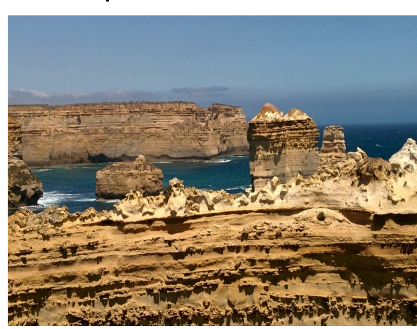
Visit the spectacular Great Ocean Road