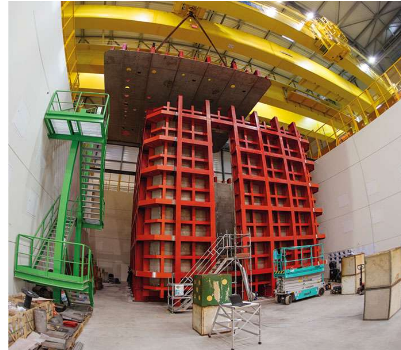
protoDUNE outer vessel

It was agreed to allow protoDUNE traffic on the Fermilab's LHCOPN link between CERN and Fermilab, as long as it doesn't impair LHC CMS traffic to Fermilab