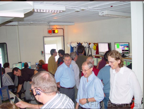
EPPOG Oct. 30, 2009