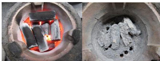
Figure 4. lighted charcoal briquettes and all burnt