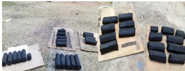
Figure 3. Charcoal briquette from motor machine and bicycle machine

3.2 Comparison property of density. When density of charcoal briquettes from both machines were compared, it was found that motor machine provided density at 907.43 kg/m 3 and bicycle machine provide density at 838.57 kg/m 3 Using motor machine and bicycle machine had different percentage of density at 7.89%. The information showed in table 1