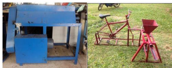
Figure 2. electrical motor machine and Bicycle machine