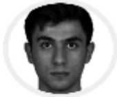
Fadl Atieh Program Support