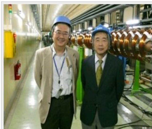
Belle II co-spokesman Masanori Yamauchi (left) with 2008 Nobel prize winner in physics Makoto Kobayashi.

Sevier and his colleagues ran the complete Belle simulated data analysis chain on EC2 to test it, and found it easy to deploy jobs. They created an Amazon Machine Image (AMI), a computing environment customized to contain both the Scientific Linux operating system and applications for the Belle analysis system. Each AMI contains eight CPU cores—imagine eight PCs—and can be duplicated 20 times, creating a virtual 160-core cluster. To lower costs, the team set up an automation system that duplicates the AMI on demand and shuts down instances of it as need drops.