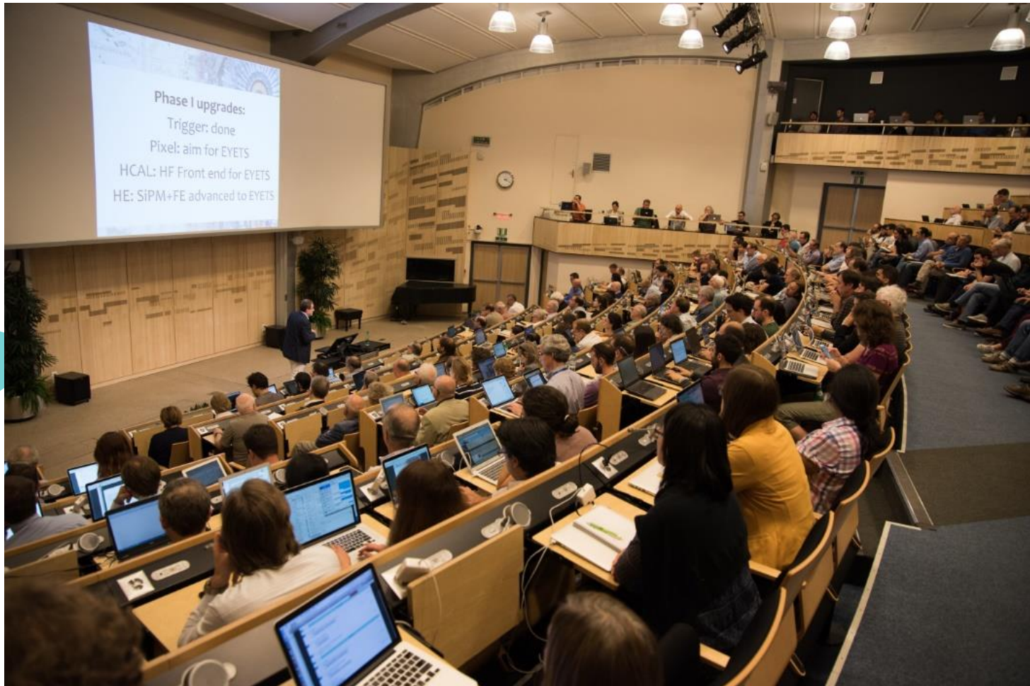
CMS meeting, 2016