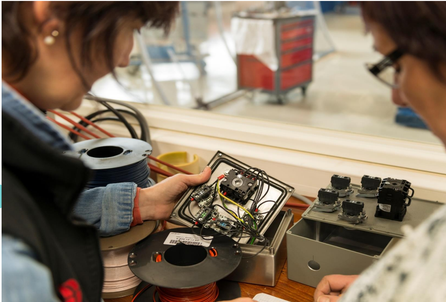
Large Magnet Facility, building 180, 2017, CERN Photo