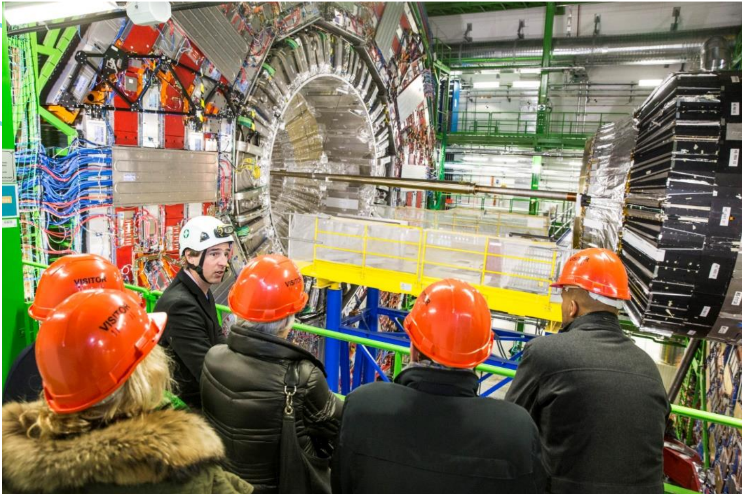
CMS visit, 2018