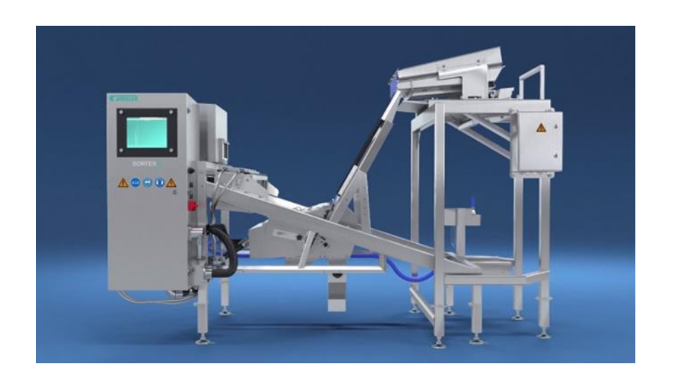
Input Accept Reject