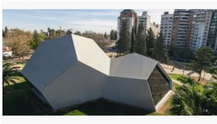
Abre sus puertas el centro de ... unciencia.unc.edu.ar