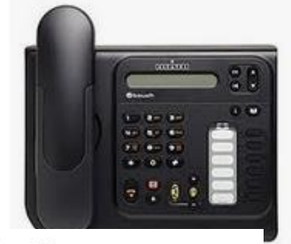
IP Touch 4018

If your phone is a "HP IP 4120" or a "Polycom CX300 or CX600", it is an old Lync phone and can use Skype for Business. Expiry date: 2023