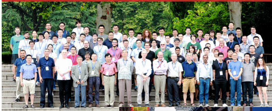
FLASY2019: 8th Workshop on Flavor Symmetries and Consequences in Accelerators and Cosmology