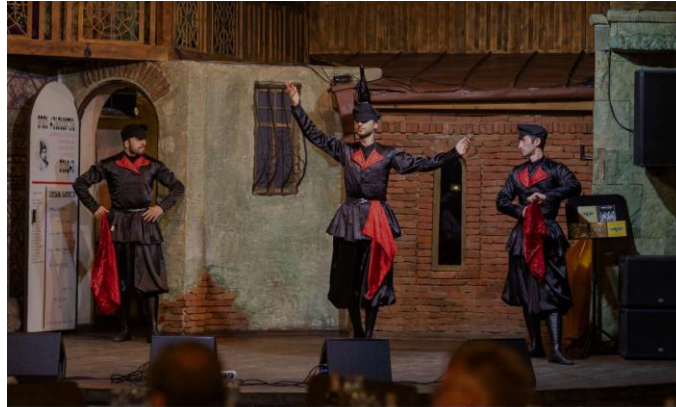
There are 5 individual thematic rooms of different concepts in the restaurant, which represent the different parts of ancient Georgia. "Papakiani"

The restaurant is located in the old part of Tbilisi, offering cozy ambience along with wonders of local cuisine. The visitors are welcome to enjoy Georgian national songs and dances on a daily basis.