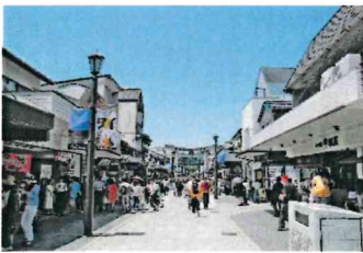
Dazaifu Tenmangu approach