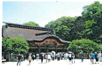
Dazaifu Tenmangu Shrine