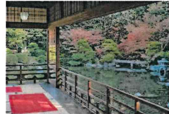
Ohori Park / Japanese Garden

13:00 Leave at Kyushu University Hospital