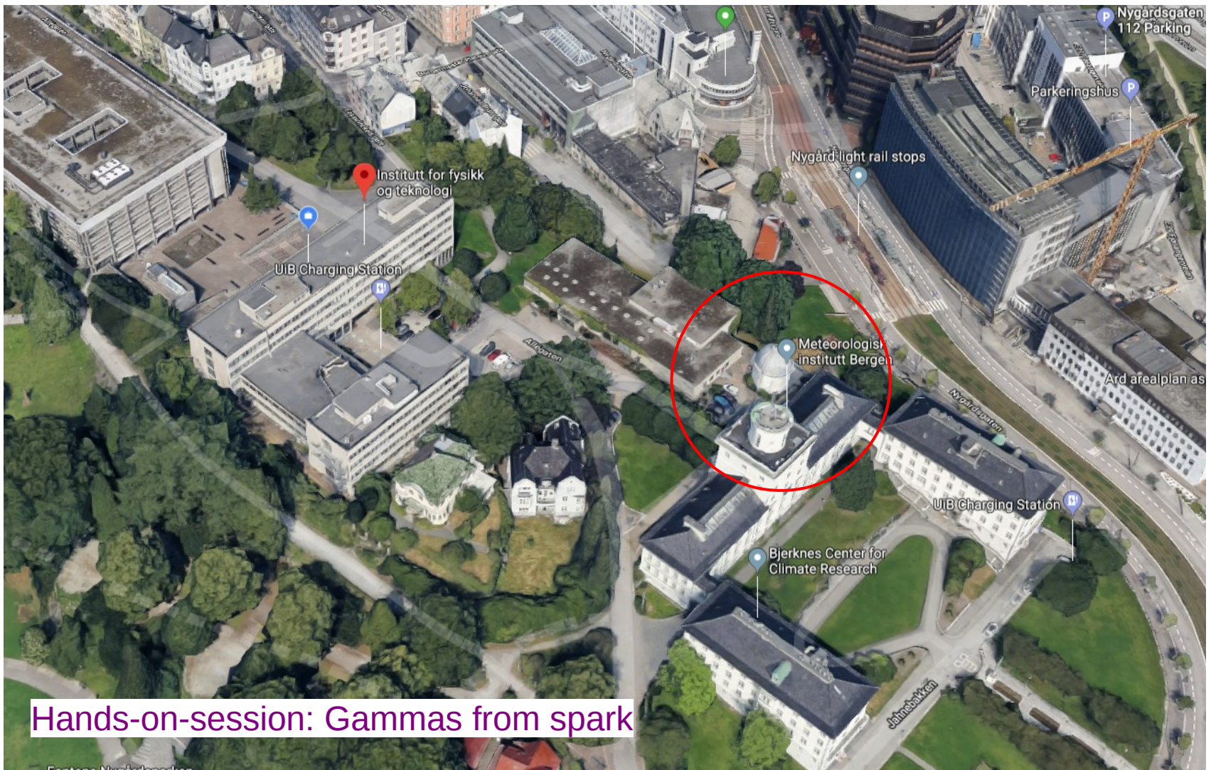
Hands-on-session: Gammas from spark