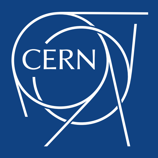
CERN. Take Part! There is only one place you can do this work, this way.