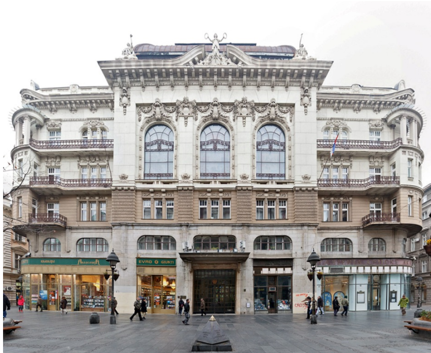
Figure 2: Serbian Academy of Sciences and Arts – Venue day 1