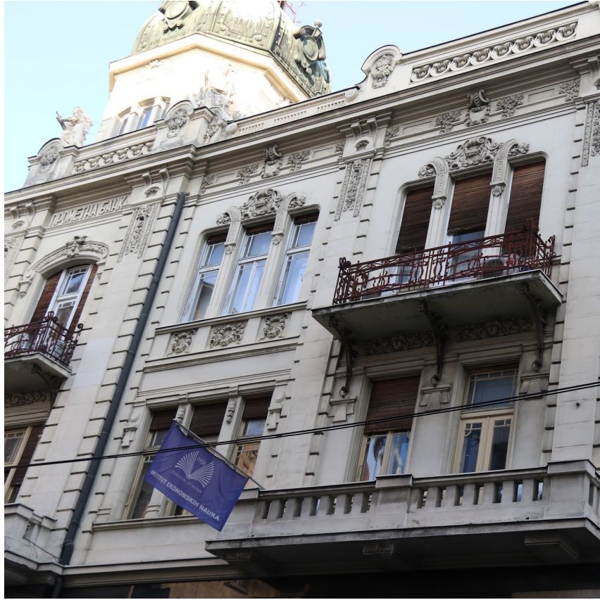
Figure 3: Institute of economic sciences – Venue days 2,3 and 4