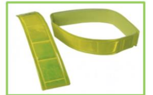
Trouser reflector strips