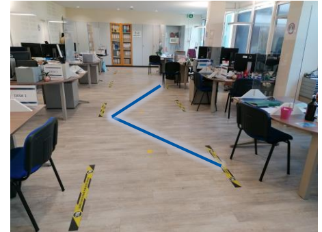
3 desks in use out of 6