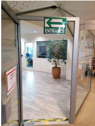
Users' Office entrance