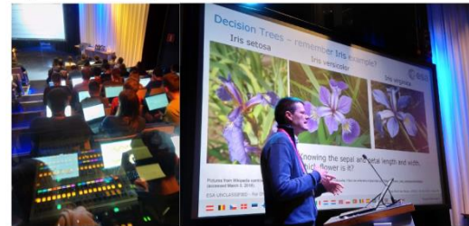
The highlight topic of ESI2019 was dedicated to Artificial Intelligence - A.I. The A.I. topic was selected as it plays an increasingly major role in supporting the development of large scientific experiments and the processing of their associated datasets across all of the EIROforum organizations as well as in our daily life. The A.I. highlight sessions took place