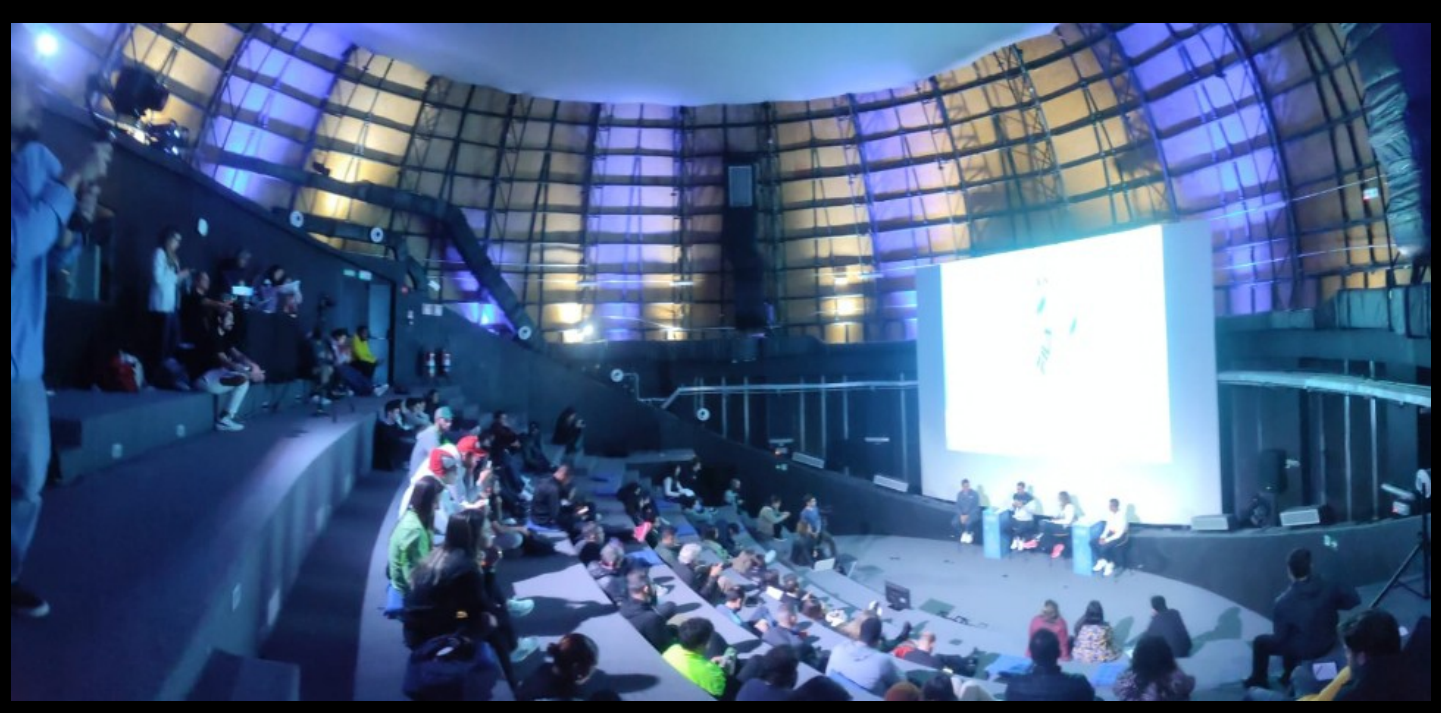
Instituto Principia (proposed venue)