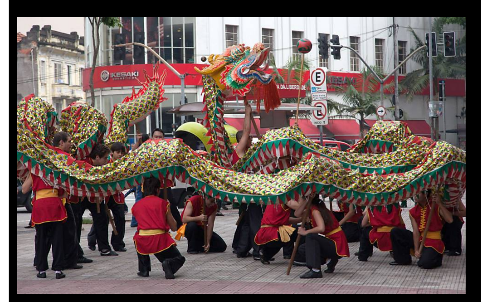
Ethnical diversity (Japanese, Arabic, Italian, Jewish, African . . ).