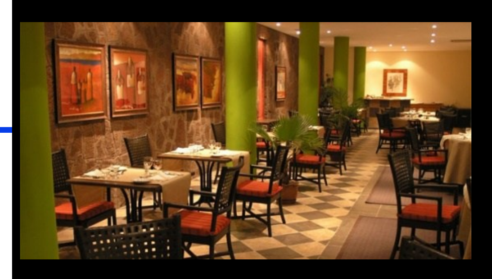
Restaurants of different styles and cuisines