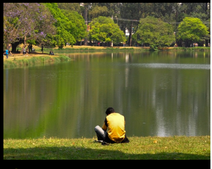
Great parks like Ibirapuera 1,500,000 square meters