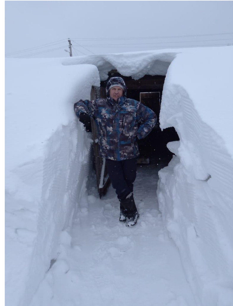
Susun 26 January 2020