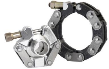
Quick Disconnect System (QDS)