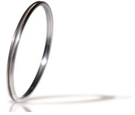
HELICOFLEX® , HELICOFLEX® DELTA