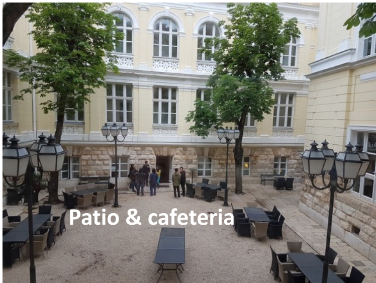
Patio & cafeteria