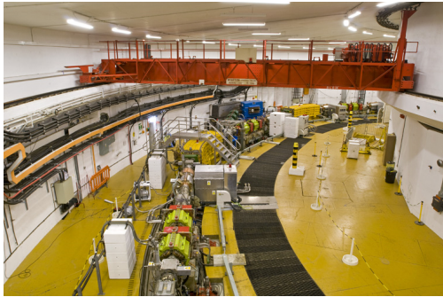
(a) ISIS Synchrotron