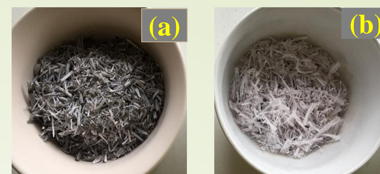
Figure 1. Color of rice straw ash from rice straw, (a) un-washed and (b) washed, by 0.1 M HCl.

Figure 1 illustrates the difference of rice straw ash obtained from rice straw. It was showed that the color of ash influenced from the pretreatment process of rice straw. The color of ash from rice straw washed with 0.1 M HCl is quite white. The study of SEM micrograph of silica xerogel that is synthesized from sodium silicate preparing from RSA by controlling the level of pH at 7, 8 and 9 as shown in figure 2 found that silica xerogels have the characteristics of a mixture of gel and particles or amorphous.