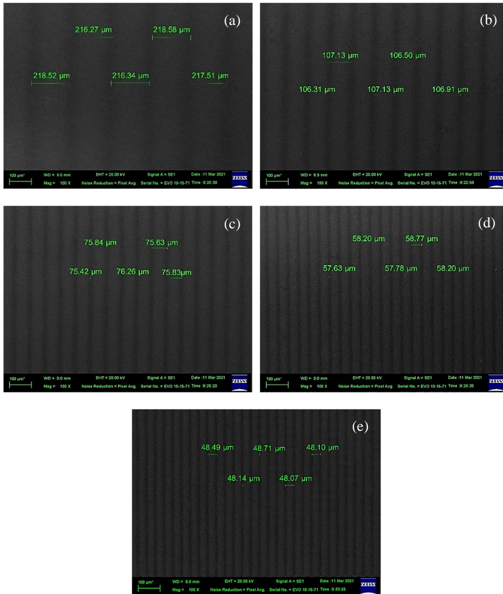
Figure 2. Image of reflective holographic gratings obtained by SEM, where (a) Sample 1, (b) Sample 2, (c) Sample 3, (d) Sample 4, and (e) Sample 5.