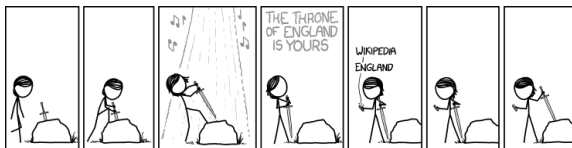
XKCD 1521 (from 2015...)