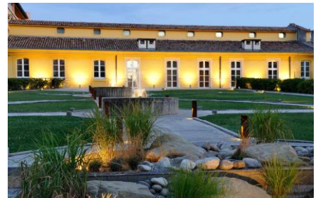
Aquabella hotel, in Aix-en-Provence (France)

Organized by the French Alternative Energies and Atomic Energy Commission ( CEA, Cadarache Center ), it will be held in Aix-en-Provence (France), at the Aquabella Hotel.