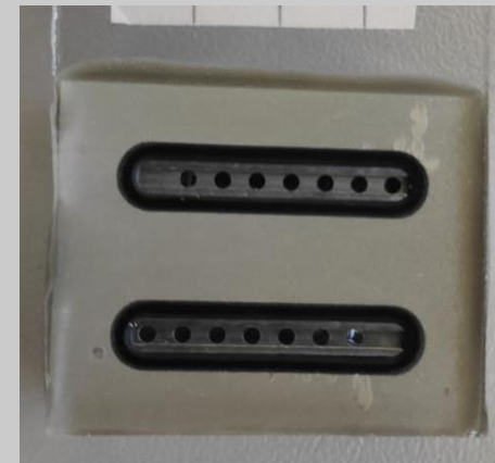
Test 2: Stencil 4; reused connector