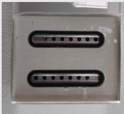
Test 4: Stencil 3; new connector