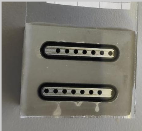
Test 1: Stencil 3; reused connector