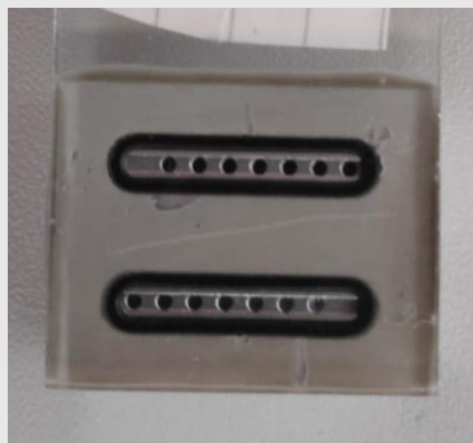
Test 3: Stencil 3; connector sandblasted at 1bar