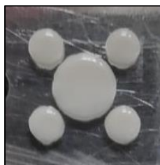
Cured outside jig: