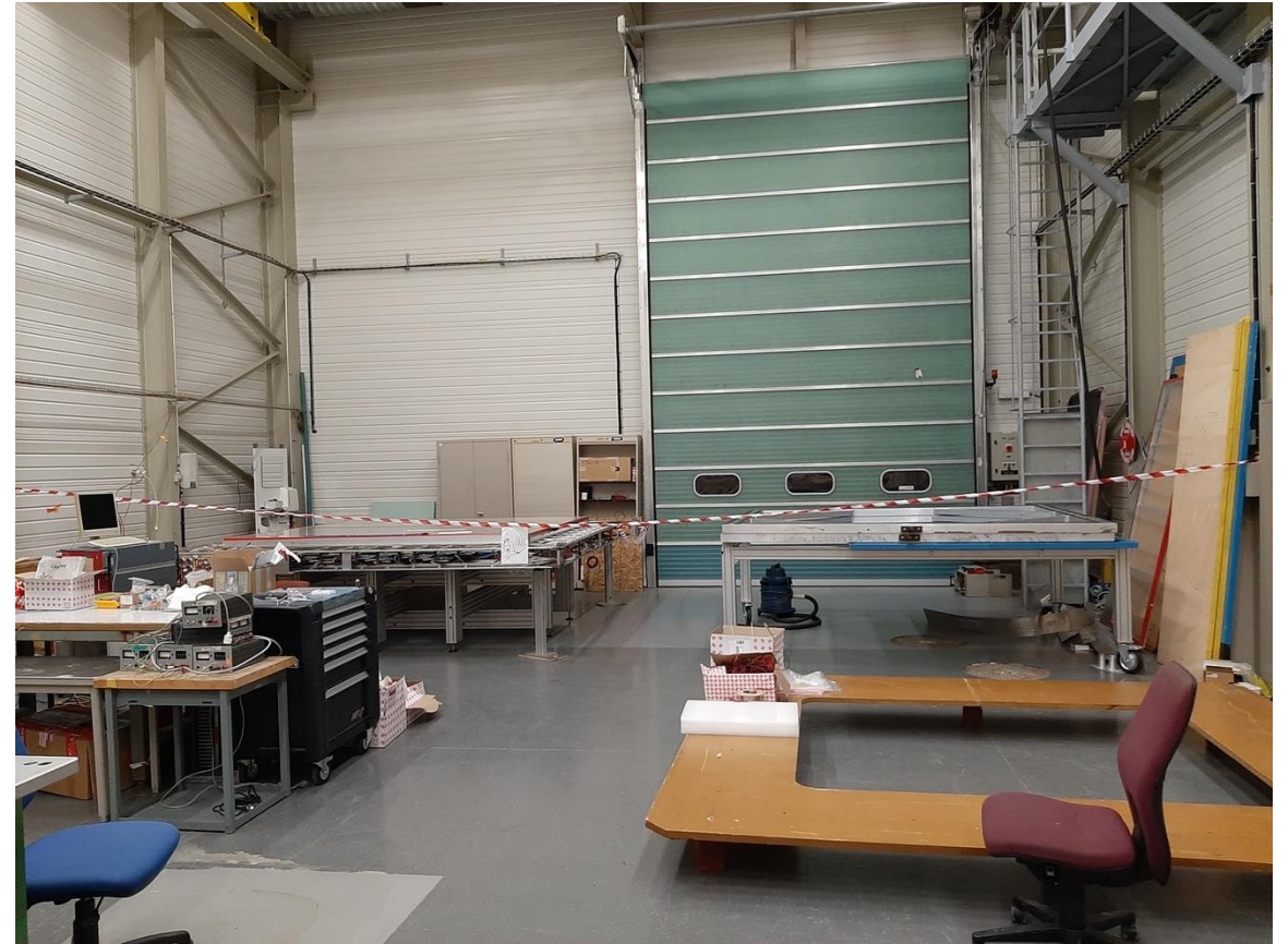
DC4 in the Clean Room during 2020