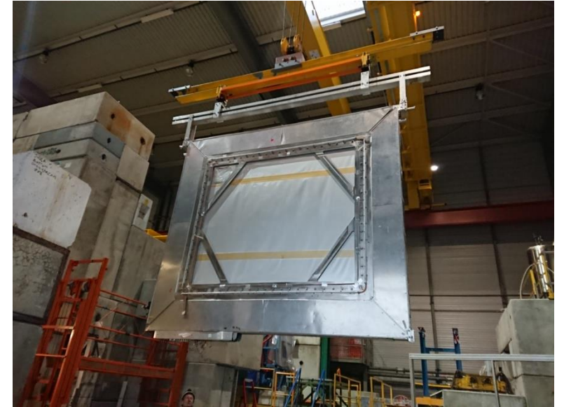
Removal of DC4 from EHN1 in January 2020